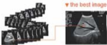
Easy access to the optimal image